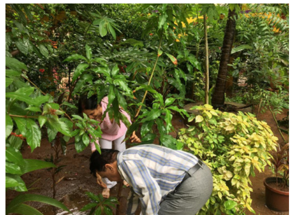
Young saplings have a field day - Getting a Head Startt