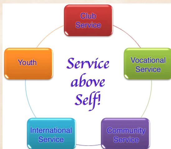
FIVE AVENUES OF SERVICE

I am exhilarated by the affection from you all... thank you very much from the bottom of my heart and on behalf of Rotary Club of Navi Mumbai Jewels, a very Big Thank You.